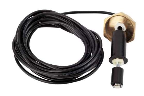
Single fuel probe (for Secure alarm)