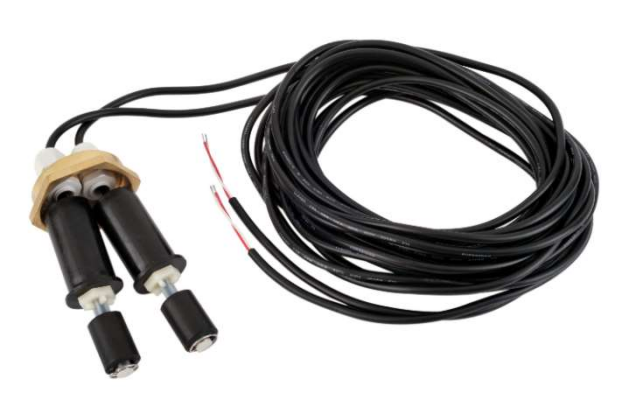
Double fuel probe (for Secure alarm)